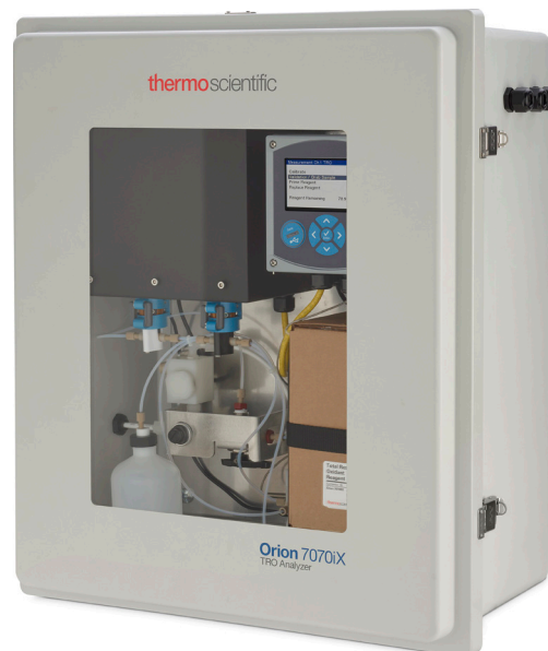
Orion 7070iX TRO Analyzer

Oxidizing biocides (e.g. chlorine) are commonly used to kill pathogens in water for disinfection in many industrial applications, such as cooling towers, drinking water and tertiary wastewater treatment. The water in these processes is often treated with chlorine, chloramine, bromine or chlorine dioxide to control microbiological fouling and pathogen levels. Strict regulatory discharge permits in many countries (e.g., United States and Canada) require that chlorine levels must be monitored online and reduced below 100 ppb or less before the water can be discharged to the environment. This introduces significant challenges to accurately measuring and controlling TRO, which is a sum of all oxidizing biocides. Process control is achieved by measuring TRO online to ensure accurate dosing to control biological growth at optimal operational cost of biocides and oxygen scavengers. More importantly, the TRO levels must be low enough for discharge to comply with the local regulatory discharge permit. Current online DPD colorimetric measurement for TRO has a few limitations, such as higher detection limit, larger error at low ppb level, drift due to discoloring reagent and poor performance in sea water and other waters with interfering ions. The new Orion 7070iX TRO Analyzer with electrode sensing technology solves these issues with significantly improved detection limit and accuracy using the existing U.S. EPA approved methods.